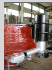
NEW Fuel Feed Auger