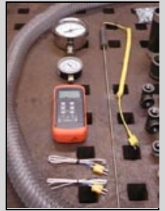
GEK™ kits, parts and instrumentation packages